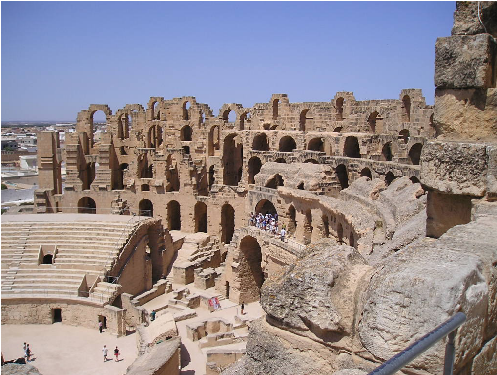
Fig. 4a El Jem