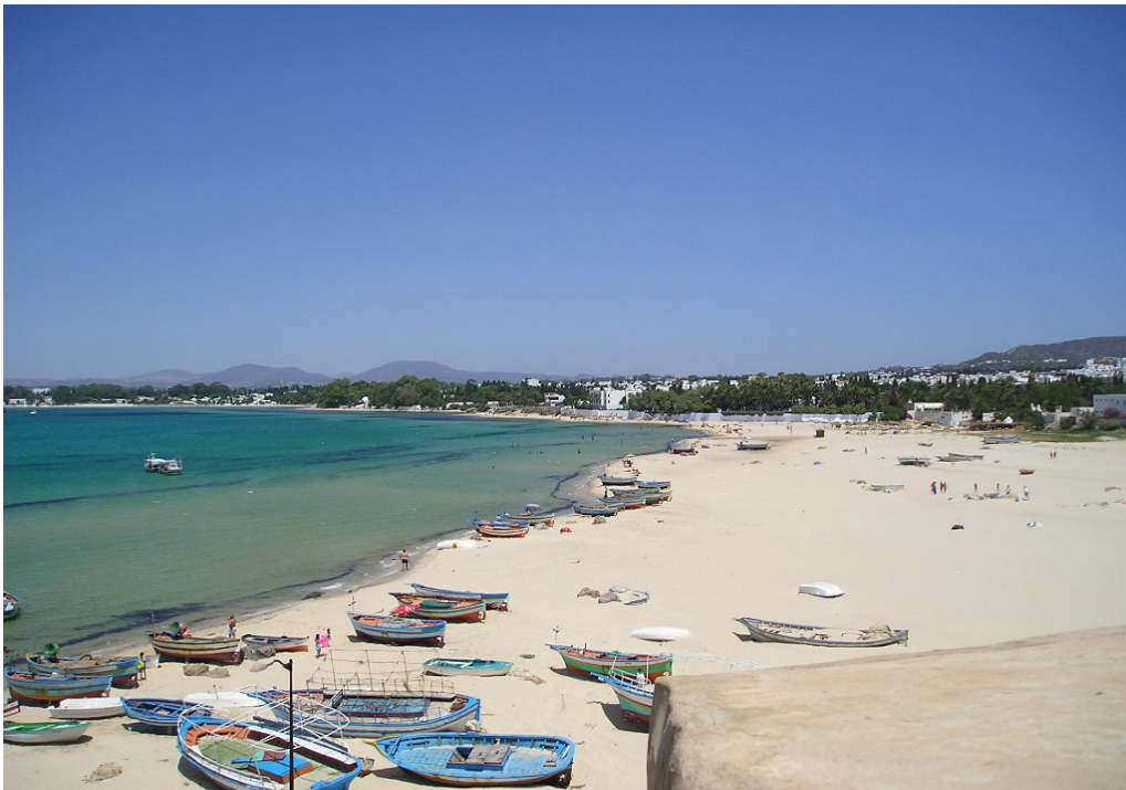
Fig. 4b Hammamet beach